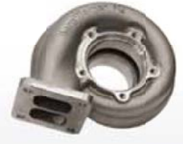
Compressor Cover SX-E Style